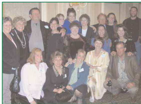
Chayah residents and volunteers