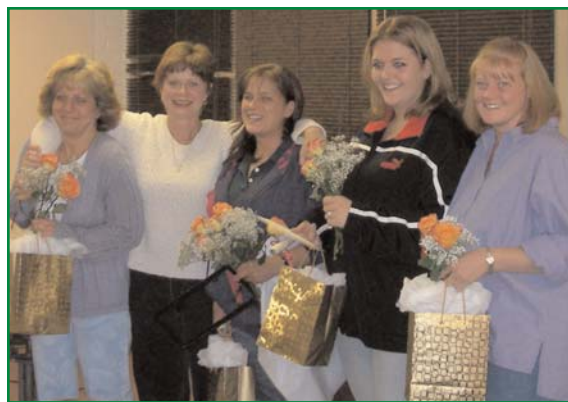
Chayah House girls celebrate successes!

opment of spiritual disciplines, and addiction recovery. The program includes identifying the sources of their poor choices in life, replacing lies they've believed about themselves with the truth of their identity in Christ, and being embraced in a loving, accepting community.