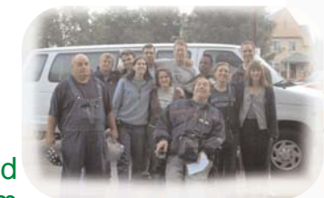
Open Door New Orleans team